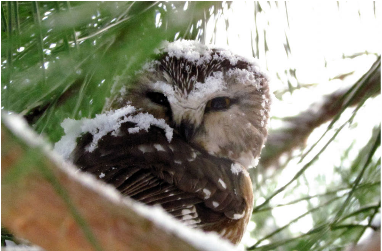
Snow-Covered Saw-Whet Owl

PUBLICATIONS MAIL AGREEMENT NO 40924050 RETURN UNDELIVERABLE CANADIAN ADDRESSES TO CIRCULATION DEPT. 330 - 123 MAIN STREET TORONTO ON M5W 1A1 email: circdept@publisher.com