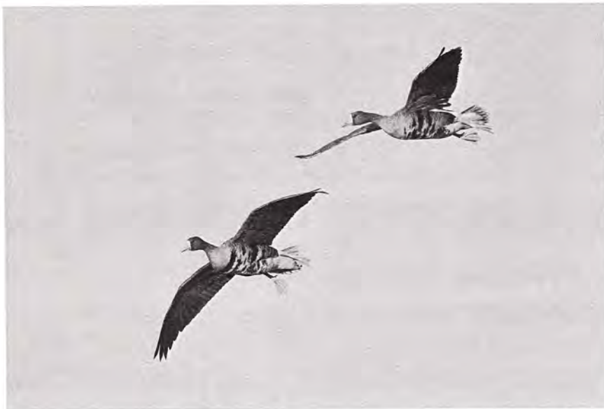
Greater White-fronted Geese

October 3rd -10th The first winter sighting of nine Greater White-fronted Geese was recorded on October 3rd. Later in the same week two small flocks of geese, one with 40 birds and another with 60 geese, were reported. If you are scanning Canada Geese you might spot Greater White-fronted Geese amongst the flocks.