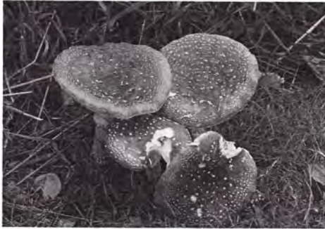
Poisonous Amanita muscalina mushrooms.

Best wishes to all for a happy and healthy 2010! The fall 2009 period was very busy, as usual. Peak visitor days this fall were September 27 th (553), October 11 th (833) October 18 th (544), October 24 th (631), November 1 st (841) and December 27 th (722). Nearly a month of nice clear days from mid-September onwards brought beautiful fall colours to the trees, showy mushrooms, school classes nearly every day, at least 14 Sandhill Cranes daily, most of the Fraser-Skagit Lesser Snow Goose population, and an influx of winter songbirds such as waxwings, woodpeckers, and sparrows.