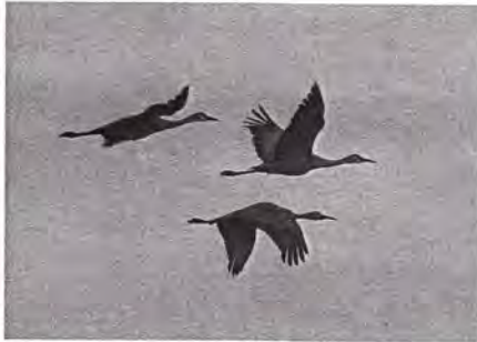
Sandhill Cranes, one with a transmitter antennae showing.