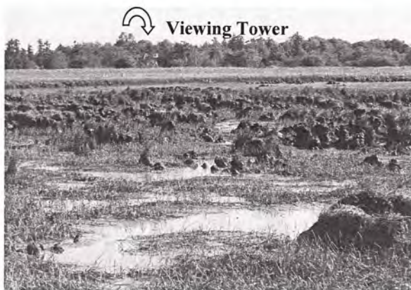
The Viewing Tower is barely visible along the skyline from the Snow Goose feeding areas.

From early October onwards, Snow Geese put on showy roadside displays on Westham Island farm fields and the fields of Alaksen National Wildlife Area (NWA). Based on the high number of young birds in the flock, the population is likely to be quite high again this year. The Sanctuary and the adjacent NWA are safe areas for the birds, but there is hunting on most farmland outside these areas. New visitors and members often don't realize there is a local Snow Goose hunting season until the sound of gunshots from these areas carries into the Sanctuary. Farmland plays an important role in sustaining the Snow Geese, regardless of hunting seasons, and most of these lands are privately owned commercial farms.