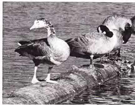
The odd hybrid goose (extreme left).

When the Snow Geese arrived, there were a few oddities in with them. Snow Geese have a blue phase, usually more common east of the Rockies, and we had at least three of these dusky birds this year in October. Greater White-fronted Geese, an Emperor Goose, Cackling (Canada) Geese and a slightly ungainly hybrid goose (probably a cross between Canada and Greylag) also travelled with Snow Goose flocks.