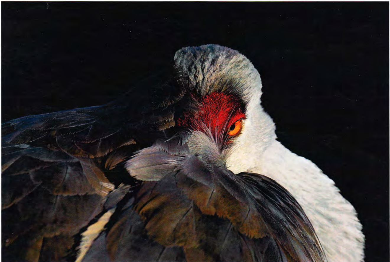
Sandhill Crane

PUBLICATIONS MAIL AGREEMENT NO 40924050 RETURN UNDELIVERABLE CANADIAN ADDRESSES TO CIRCULATION DEPT. 330 - 123 MAIN STREET TORONTO ON M5W 1A1 email: circdept@publisher.com