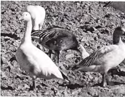
A blue phase adult Snow Goose (centre).