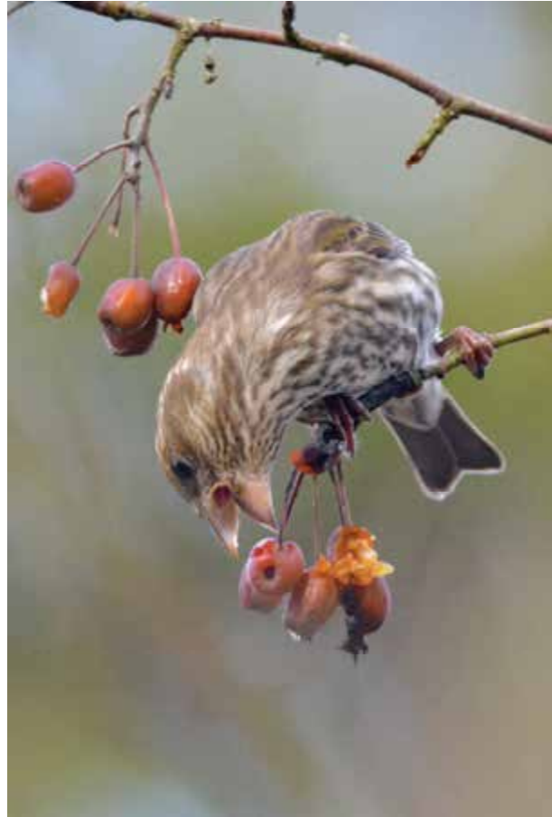
A Hungry Purple Finch

Ten species of sparrows and three species of finches were present this week. Have you ever noticed on the male House Finches that they vary in color from red to orange and even yellow? The red on the males comes from pigments contained in food eaten during molt. The more pigment in the food the redder the male. New birds species showing up this week were White-throated Sparrow, Hutton's Vireo and Lincoln's Sparrow. A Varied Thrush was seen this week, although most are heading to nest in the forests of northern British Columbia and Yukon. Northern Saw-whet Owls are still being found. We have one