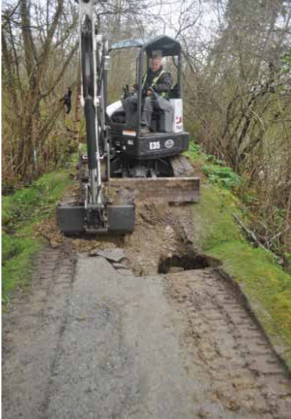
Trail reconstruction on Center dyke

Sanctuary visitors are always required to stay on the trails, but in the case of the grassy-lined pathways on the outer seaward side, this is particularly important. Anyone standing on the shoulders or climbing down the embankments can cause the soft silt to shift and start eroding. Please also note the No Bird Feeding Notice on page 5.