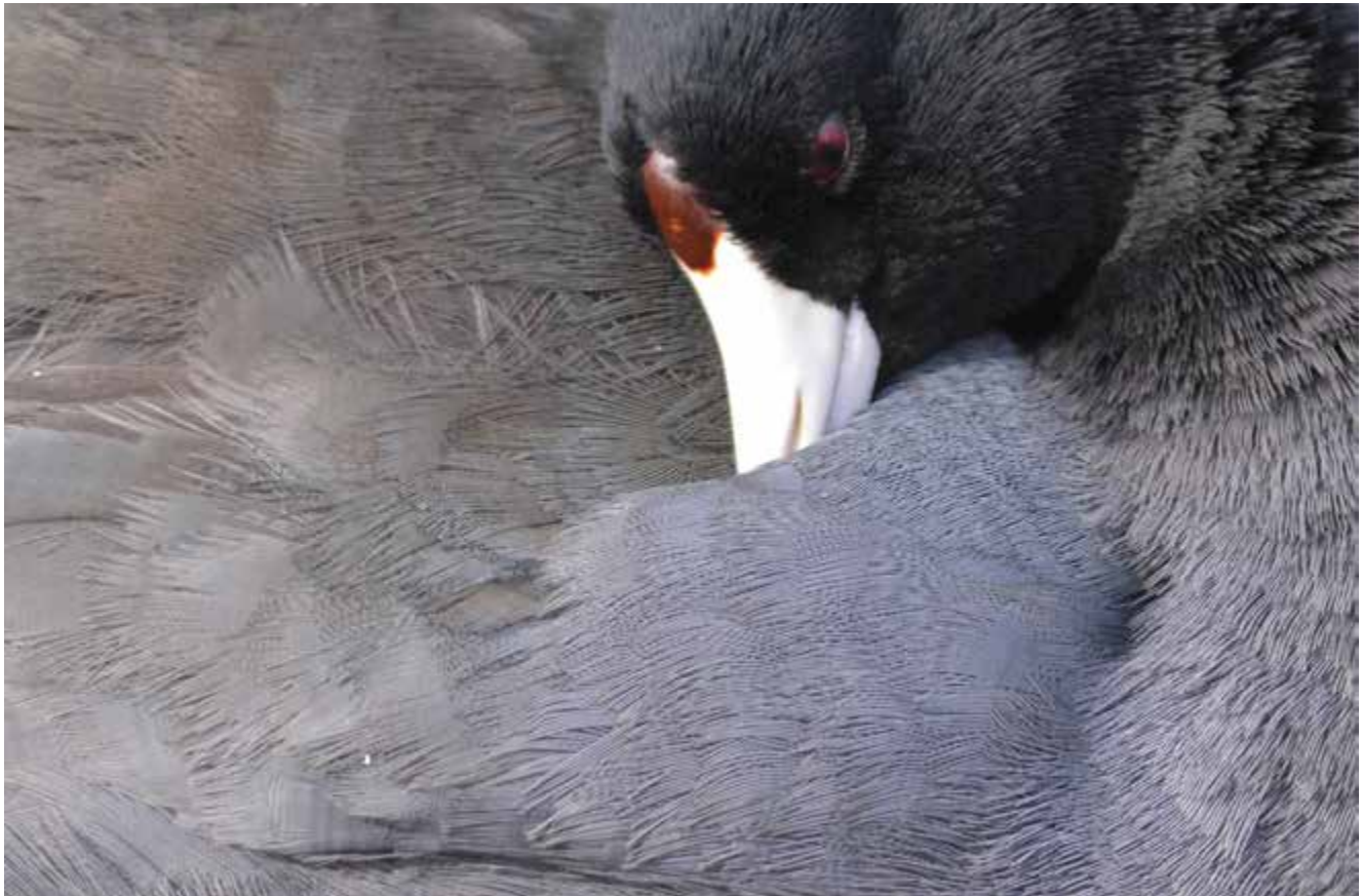
American Coot Preening

PUBLICATIONS MAIL AGREEMENT NO 40924050 RETURN UNDELIVERABLE CANADIAN ADDRESSES TO CIRCULATION DEPT. 330 - 123 MAIN STREET TORONTO ON M5W 1A1 email: circdept@publisher.com