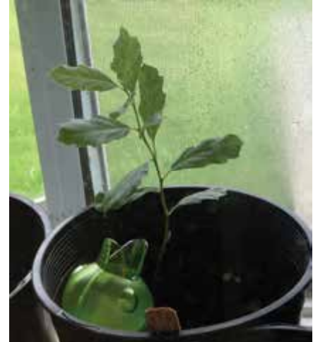
The Cork Oak (left) damaged by the heavy snow of February 23rd and a seedling (above) grown from one of last fall's acorns.

in 1 box, 9 others had squirrel nests, 2 were rat homes, and a mink seemed to be using one as either a storage larder or a latrine site. Wood Ducks were up in the trees within days of our box maintenance, checking out the nest potential of their favourite boxes and we are pretty sure some were on nests by late March but don't like to pry.