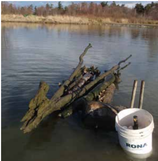
Remnants of the 2013 nest island

The crane island needed some help again this year, and is now a constructed item of bricks, chains, logs, gravel, topsoil and some rotten birch logs. We started seeing our resident pair start to guard the center pond area as a territory around March 9th onwards. Some Canada Geese had a brief but predated nest on this key island, then the resident pair of cranes took possession Sunday April 6th. They are incubating two eggs laid April 9th and 11th.