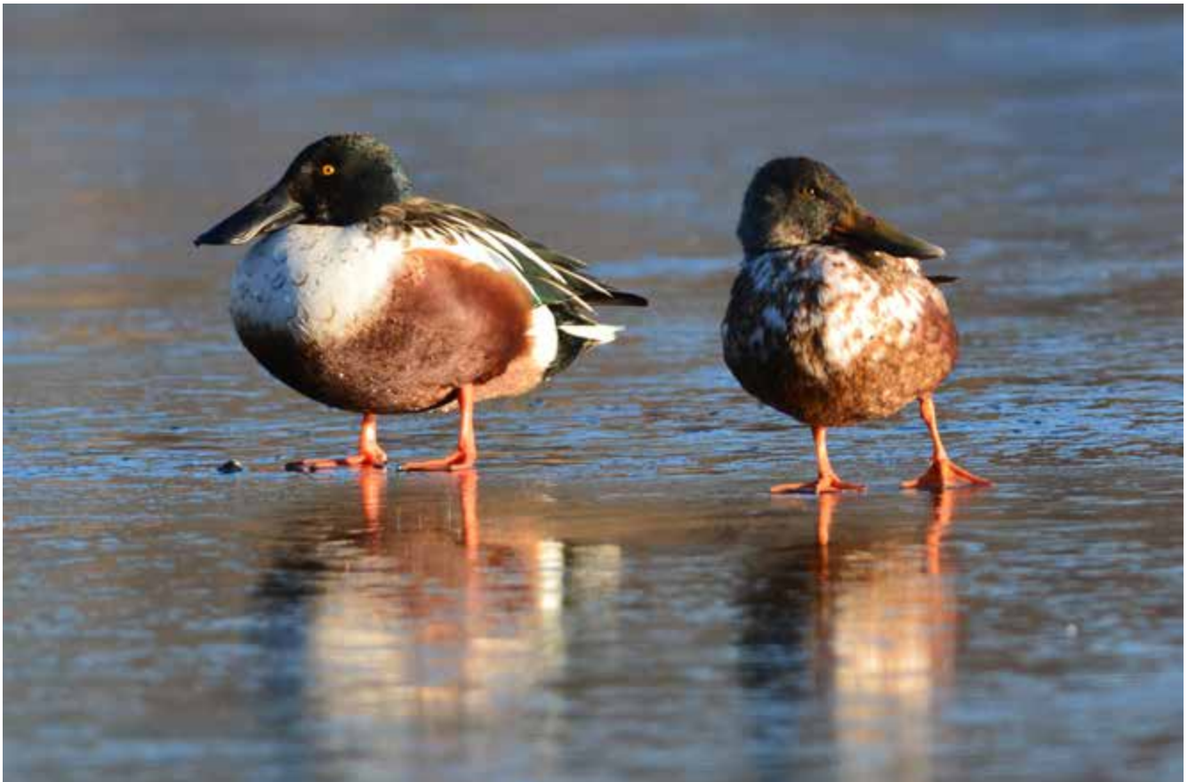
Shovelers On Ice

PUBLICATIONS MAIL AGREEMENT NO 40924050 RETURN UNDELIVERABLE CANADIAN ADDRESSES TO CIRCULATION DEPT. 330 - 123 MAIN STREET TORONTO ON M5W 1A1 email: circdept@publisher.com