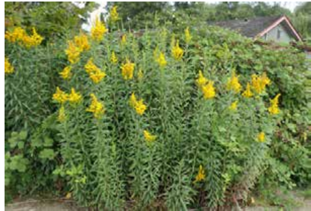
Goldenrod (above) and Silverweed (below).

network of small red runners and edible roots. It has small buttercup-like flowers and compound leaves that are green on the top surface and silvery-white on the underside. It grows in wetlands and needs moisture, so we see more of it when we have cool wet summers or at least some rain during the summer.