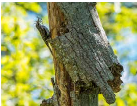
Second Nest Site