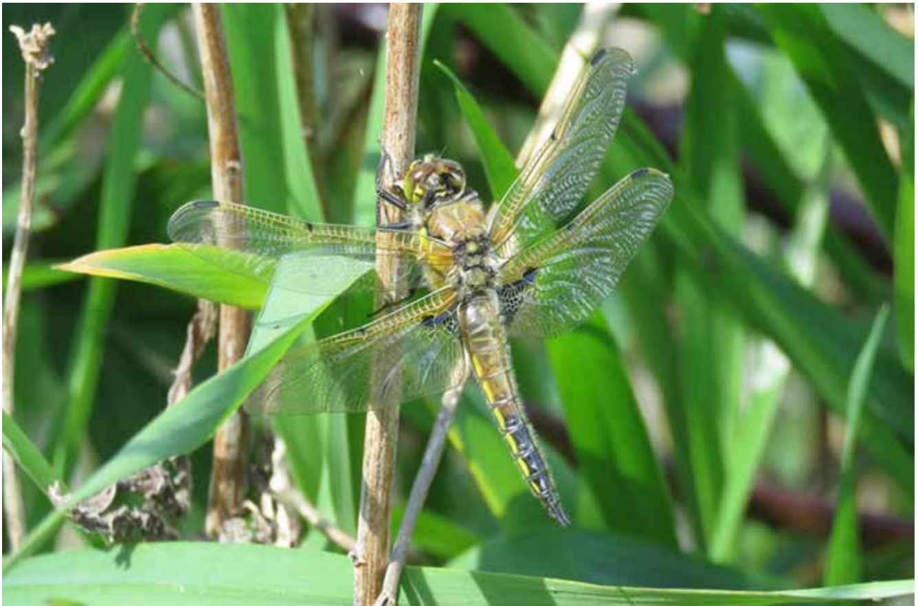
Four-spot Skimmer Dragonfly

PUBLICATIONS MAIL AGREEMENT NO 40924050 RETURN UNDELIVERABLE CANADIAN ADDRESSES TO CIRCULATION DEPT. 330 - 123 MAIN STREET TORONTO ON M5W 1A1 email: circdept@publisher.com