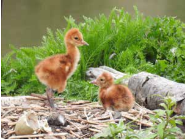
Two Crane colts May 26 th

Along the East Dyke visitors have begun to notice adult Brown Creepers carrying food heading into an opening in the bark of a tree. Brown Creepers build a hammock style nest which is constructed from twigs then lined with feathers, leaves and lichens, usually in a dead or dying tree. On the 24 th a Western Wood-pewee (Flycatcher family) was spotted. With a pale belly, dark back, no eye ring and two white wing bars this bird is far from showy. On the 25 th a Hermit Thrush was found along the driveway. This small thrush has a distinctive white eye ring, black spotted under parts, a rufous tail and in my opinion has one of the most attractive songs of the forest.