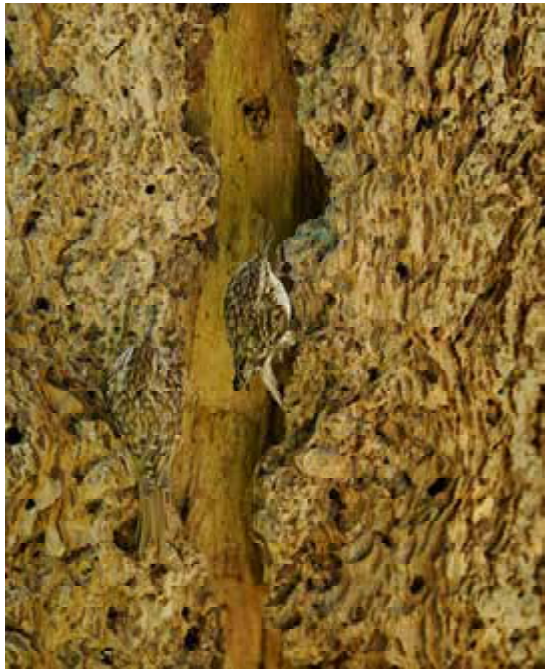
Cryptic Brown Creepers