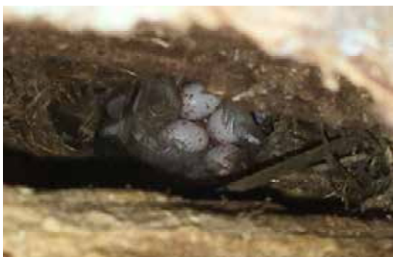
Brown Creeper Eggs