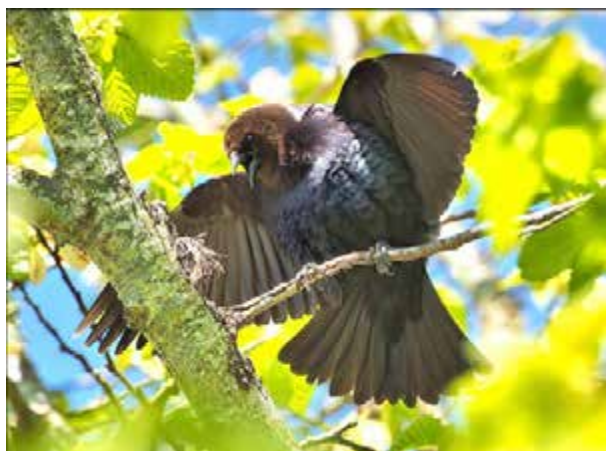
Brown-headed Cowbird

In April nesting is prevalent and a good time to view shorebirds and warblers as they pass through on their way north to nest. However this spring didn't turn up many varieties or big numbers of the latter. This could have been due to the stretch of good weather we had. This would have made it easier for birds to pass through and not get held back by inclement weather. Out of 91 species recorded for the month, new arrivals included Cinnamon Teal, Redhead, Western Sandpiper, Mew Gull, Orange-crowned Warbler, Common Yellowthroat, Western Meadowlark and Brown-headed Cowbird.