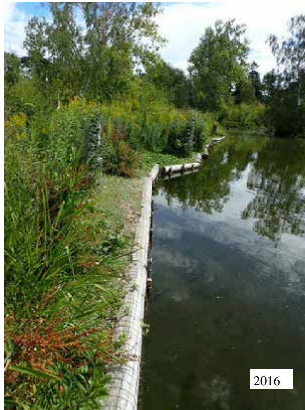
The same shoreline before and after the restoration project in Display Ponds