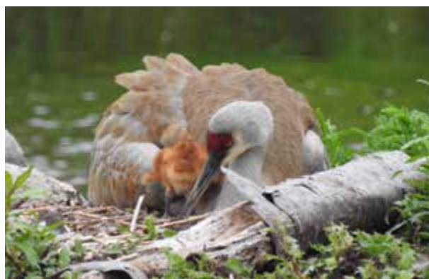
First Sandhill Crane colt trying to see the second colt under the adult female crane.

* staff have tried to rescue drowning chicks twice unsuccessfully