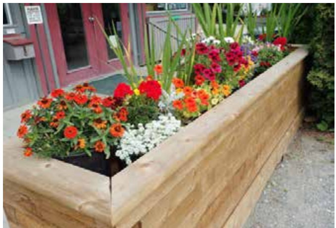
The new planter box