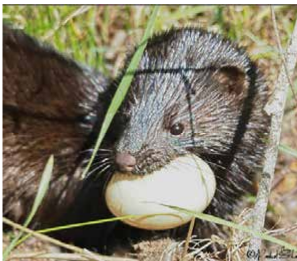
A Mink with a duck egg

nest site when taking food to their young, and are one of the worst predators of songbirds. Many Mink are noticeable right now as they peruse the trail edges and waterways in search of eggs from the nests of ducks and geese. It is not unusual to find late broods of ducks into June and even early July, as some have re-nested due to mink predation. This week, the last of the wintering Trumpeter Swans moved out on their way north. They will be back in November.